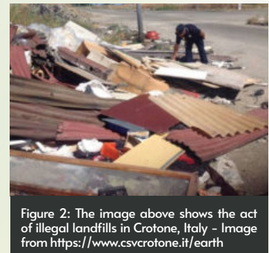
Figure 2: The image above shows the act of illegal landfills in Crotona, Italy - Image from https://www.csvcrotona.it/earth

In Italy, 2000 square metres of land occupied by waste were discovered in Empoli.