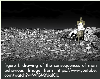
Figure 1: drawing of the consequences of man behaviour. Image from https://www.youtube.com/watch?v=WfGMYdaICIU

More importantly, hydrogen can be used to store the excess energy obtained from renewable sources (solar, wind), and reduce the need for batteries in the future. A similar research is being conducted in Europe, with the EU-funded HYTIME (Low temperature hydrogen production from second generation biomass) initiative. 8