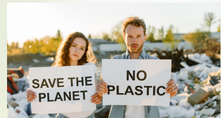
Figure 2: example of people following this academic paper behaviour.

This paper would help protect human health. Recently the secretary general of the United Nations gave a speech calling everyone to their responsibilities, the president said “in a few days the population of our planet will exceed a new threshold”, we will reach 8 billion people. How will we respond when the “8 Billion baby” is big enough to ask, “What did you do for our world and for our Planet when you had the chance?” We are fighting for our life and we are losing it.