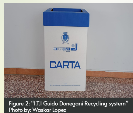
Figure 2: "I.T.I. Guido Donegani Recycling system"

The European Union, in the 2018 Waste Framework Directive 5 , states a 5 steps Waste hierarchy: Preventing waste is the preferred option, followed by reusing and resigning; recovery (also energy recovery) and disposal into landfill should be the last options. This is what may be easier to remember as the 4Rs: Reduce, Reuse, Recycle and Recover.