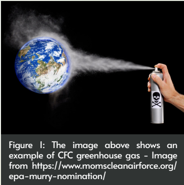
Figure 1: The image above shows an example of CFC greenhouse gas - Image from https://www.momscleanairforce.org/epa-murry-nomination/

The latter, to be disposed of, are sent to landfills. In some countries, like ours, there is also another type of disposal: separate collection; liquid waste includes insecticides, fertilisers, chemical fertilisers, mercury, expired liquid medicines, used battery liquids, which are very harmful to the environment as they reach underground aquifers and can damage their delicate balance; gaseous waste are those such as CFC, expelled from the cans at the time of use.