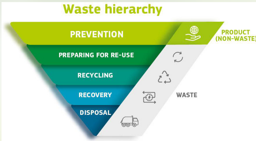
Figure 1: waste hierarchy, from https://environment.ec.europa.eu/topics/waste-and-recycling/waste-framework-directive_en

The health of the soil is worsening over time and the main cause is man and his self-centeredness, who thinks only of the direct benefits that the soil brings and neglects the consequences of his behaviours that will present problems to future generations and are undoubtedly killing the soil and the entire planet Earth!