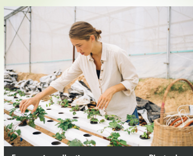
Farmer is collecting new crops

Considering the intensive use of antibiotics for the livestock in intensive farming, large amounts of these contaminants are to be found in the manure.