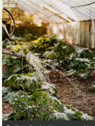
Fertiliser dissolved in water, used in a greenhouse

Water is the base of life on Earth and covers over 71% of its surface. About 97% of it is salt water consisting mainly of seas and oceans; the remaining 3% is fresh water. Only a small amount of freshwater is directly available for humans in the form of surface water (rivers, lakes, wetlands), because most of freshwater is in the "solid" form (icecaps and glaciers, 66.7%), and about 30% is existing below the surface as groundwater. <sup>1-2</sup> Water is usually classified into fresh and salt water, but it can also be classified according to its chemical physical and biological characteristics.