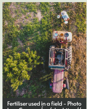
Fertiliser used in a field