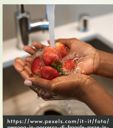
https://www.pexels.com/it-it/foto/persona-in-possesso-di-fragole-rosse-in-confezione-di-plastica-6004132/ - photo by RODNAE Productions

Now we are starting to design facilities in a circular way, meaning that precious water is used again and again for different purposes. Even if this application is initially expensive, the cost is justified by the benefits in terms of water savings. "What we do is just a drop in the ocean, but if we didn't, the ocean would have one drop less." — Mother Teresa