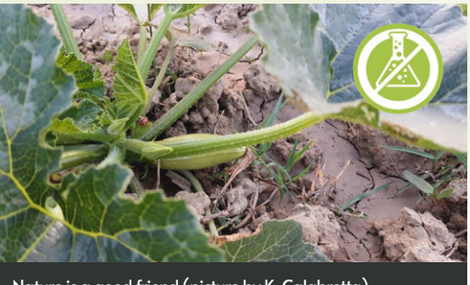
Nature is a good friend

These are the goals of sustainable agriculture, which can reap the great benefits of emerging technology such as IoT, data analysis and the Blockchain in the so-called Agriculture 4.0. Despite trying to be more sustainable, the agricultural field still has a strong impact on the environment. Among the most critical factors there are: greenhouse gas emissions from farms and the use of pesticides, which harm the biodiversity of territory.